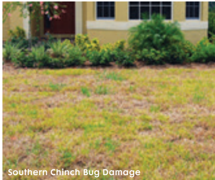
Southern Chinch Bug Damage

Arena ® 50 WDG Insecticide 1 has received a 2ee label that provides more rate options and added flexibility to control the Southern Chinch Bug in St. Augustine grass in Florida. You now have the option to use performance-proven Arena twice per year at 6.4 oz/A or save labor and apply once per year at 9.6 oz/A for longer control or 12.8 oz/A for season-long control. Save time and add value by choosing the rates that fit your spray program.