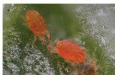
Red spider mite